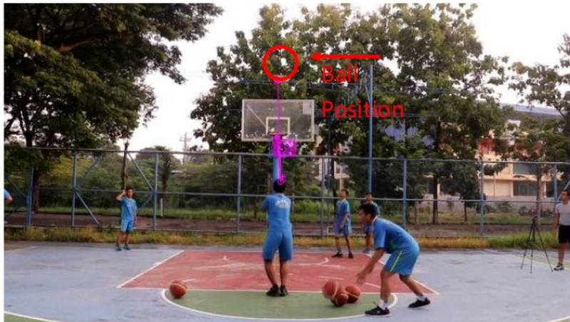
Figure 1. The Angle between the maximal ball position with the basket

This is a quantitative research with comparative study. There are four main data in this research, such as ball direction, launching angle, ball velocity, and maximum elevation. The ball direction was recorded by Canon 80D + Canon 18-135 mm STM with HD 50 fps (1280 x 720). The launching angle, ball velocity, and maximum elevation were recorded by GoPro Hero 5 Action Camera with 120 fps (1080 x 720).